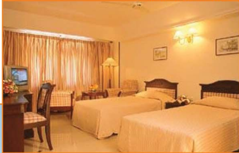
STANDARD TWIN BEDDED ROOM