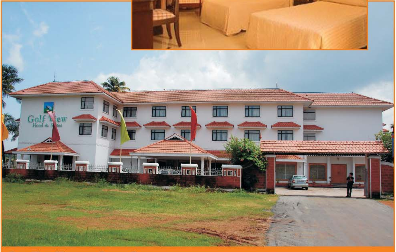
GOLF VIEW HOTELS & SUITES COCHIN