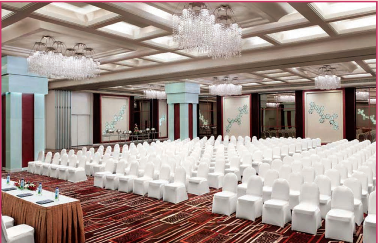
BANQUET HALL CORONET